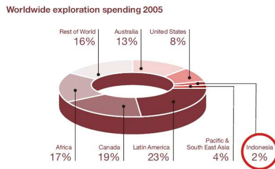
Table 2 – Indonesia's Exploration Spending

Mining has been one of Indonesia's top industries for foreign investment. It contributed 50,197 billion Rupiahs or around US$5.5 billion to the economy in 2005, which accounts for 2% of the GDP. Total government revenues from taxes and royalties increased 62% to US$2.7 billion, a record for the last 10 years. (mineIndonesia, 2006) Yet, the same survey by PricewaterhouseCoopers notes that the country continues to lag behind global trend of new investments. Canada's Metals Economic Group (MEG) budgeted worldwide exploration in 2005 at US$5.1 billion. Current exploration spent in Indonesia is only 2% of the global total (Table 2). This is noteworthy in that expenditure on greenfields explorations is critically low in Indonesia, and dropped from an average of US$40 million (1995-1997) to US$7 million (2001-2005).